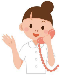
Caller (Aunt Kavya)

Assume your baby's first birthday party falls on next Tuesday: